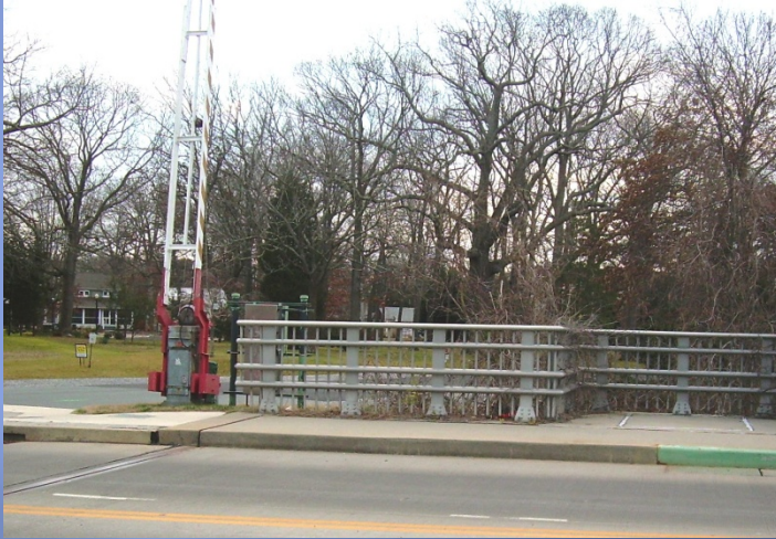
Eastbound: Hayrack planters – 3 units