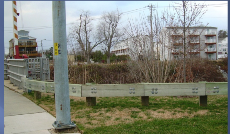
Westbound: Hayrack planters – 1 unit